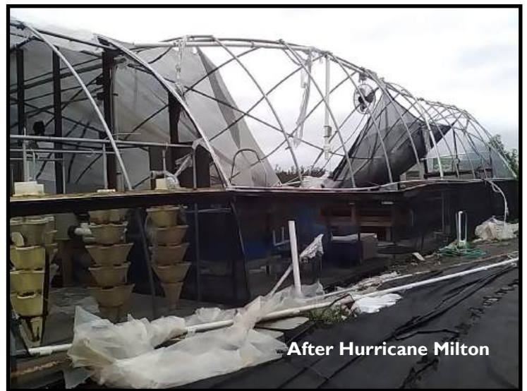
After Hurricane Milton

The plan to rebuild took considerable assessment of many factors and we believe this is God's work that needs to continue. We will eliminate the aquaponic component which is the tilapia rearing tanks and focus on hydroponically grown plants in the new greenhouse. The outside portions of the farm and fruit tree section are intact so will continue to produce as before the storm.