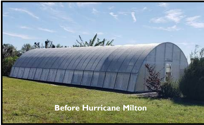
Before Hurricane Milton