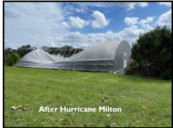
After Hurricane Milton