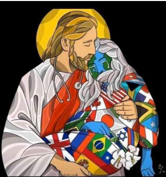
Jesus embraces a Corona victim