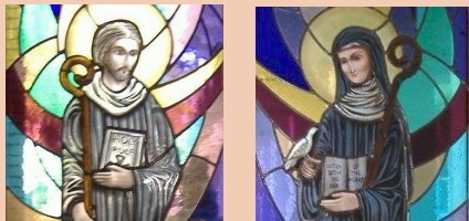
Saints Benedict and Scholastica