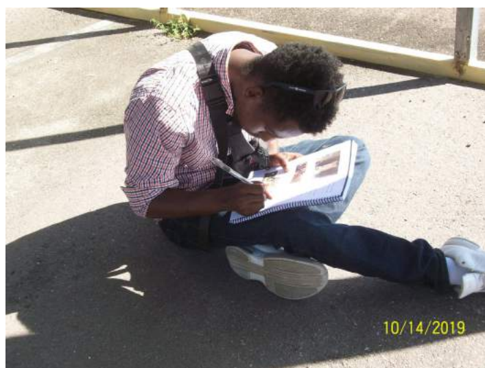
Getting all the notes down!

Participants relied on a 123-page Aqua-Grow manual, made notes when in outdoor events taught by 3 other