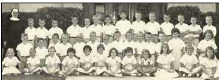
Class of "hundreds" or so it seemed ...